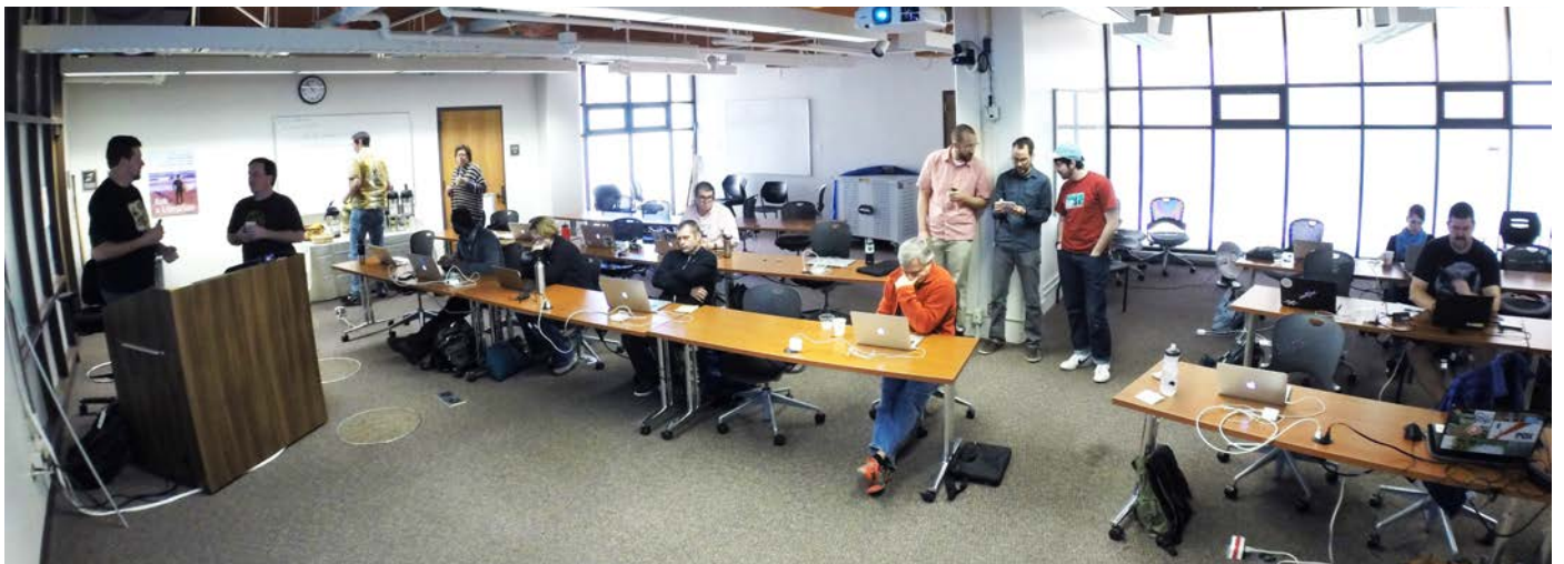
Hydra Camp at University of California , Santa Barbara, February 2016

Hydra has long recognized the value that a robust vendor community brings to an open source project. Commercial firms help with implementation, consulting, training and maintenance, and can often do the heavy lifting and bootstrapping for institutions that are seeking to start up with the project. In 2016, we saw more than a dozen companies and individual contractors provide Hydra-related services to the Community, with strong clusters in the US and UK, and we see this growth continuing into the future.