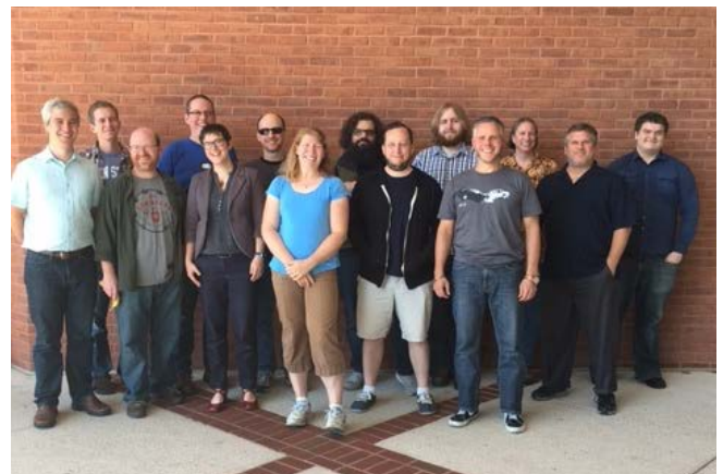
Developer Code Congress (Concentrate) Penn State, September, 2016

Members of the Hydra Community in the UK have met several times to discuss their existing and potential involvement with Hydra. In June 2016 these nine organizations signed a consortium agreement which sets out their intention to work together in order to further the take-up and use of Hydra and Fedora installations in their region. Later in the year, the group sought to broaden participation by inviting other European users to join them. The intention is that, going forward, there will be three meetings each year.