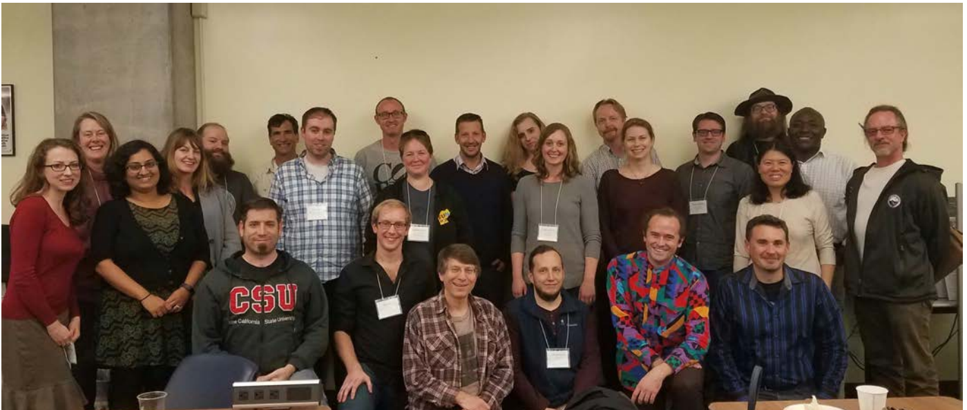
West Coast Regional Meeting, University of California, Santa Cruz, February, 2016